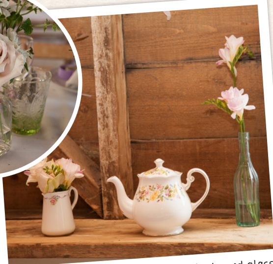
For our table decorations we used old coloured glass and china candlesticks, vintage china cups and tea pots, old glass bottles and jugs.