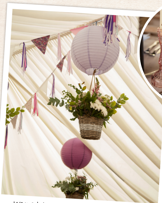
We made lengths and lengths of tassel and fabric bunting to add colour to the barn, marquee and fences.