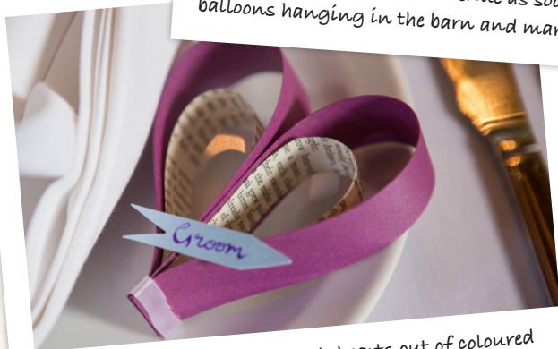
For our name places we made hearts out of coloured card and old books then stuck everyone's name on a little arrow in calligraphy.