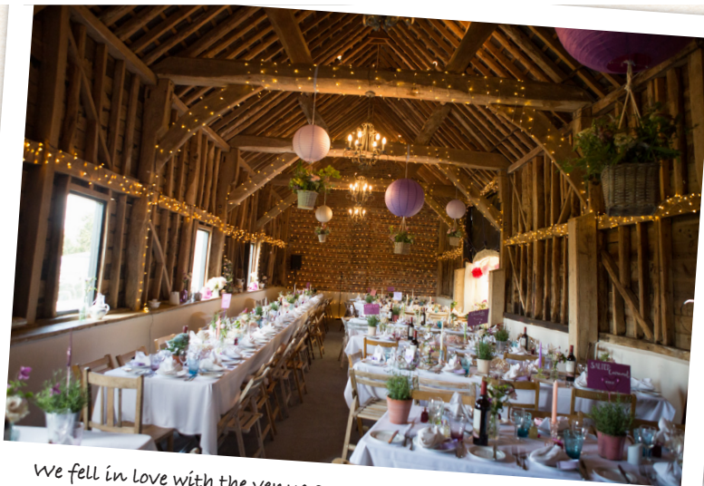
We fell in love with the venue as soon as we saw it. We had hot air balloons hanging in the barn and marquee with baskets full of blooms.