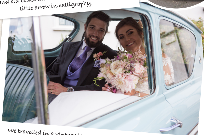
We travelled in a vintage blue Ford Anglia. It was a lovely time for us to soak it all in and enjoy those cherished first moments as husband and wife.