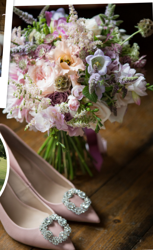
Our bouquets were made with café au lait dahlias, flowering mint, garden roses, astrantia, astilbe and summer foliage. Our florist did a fabulous job.