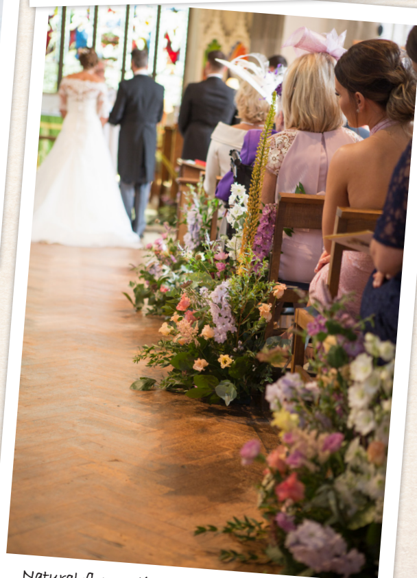
Natural flowers lined the aisle. It was stunning and really set off the rustic country theme we were going for.