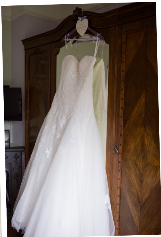
I loved my dress, it was perfect in every way. It had a lovely train and I added a lace off-the-shoulder top to finish the vintage look.