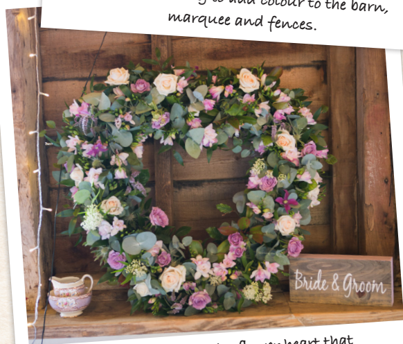
Our highlight was the flower heart that our florist lovingly created to hang behind us at the wedding breakfast.