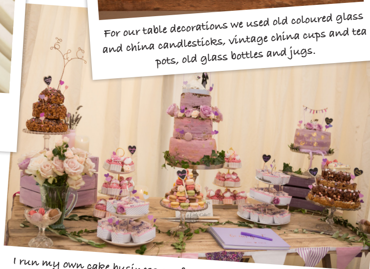
I run my own cake business so of course I had to make our wedding bake! We had a table full of our favourite flavours, cupcakes, mini loaves and macarons. It was really eye-catching in the marquee.