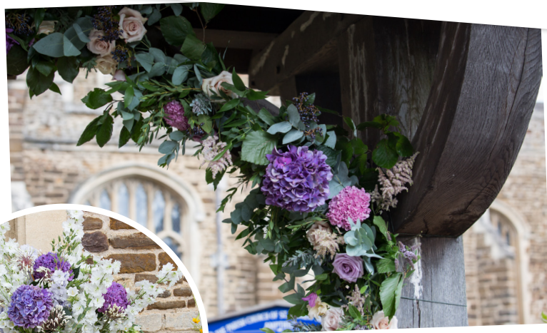
At the church we had a beautiful flower arch at the entrance porch and two vintage milk churns either side of the door full of blooms.