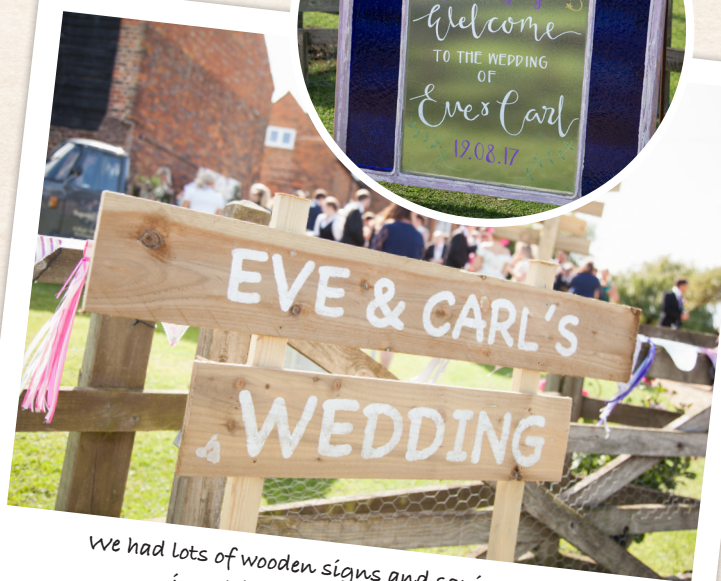
We had lots of wooden signs and sayings written in calligraphy around the venue.