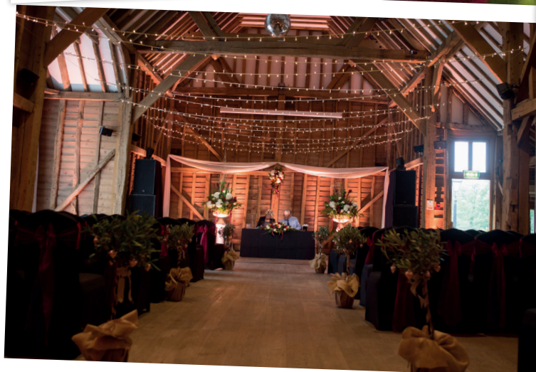
We loved Tewin Bury Farm. It was the barn setting we knew we wanted and the main room was very pretty.