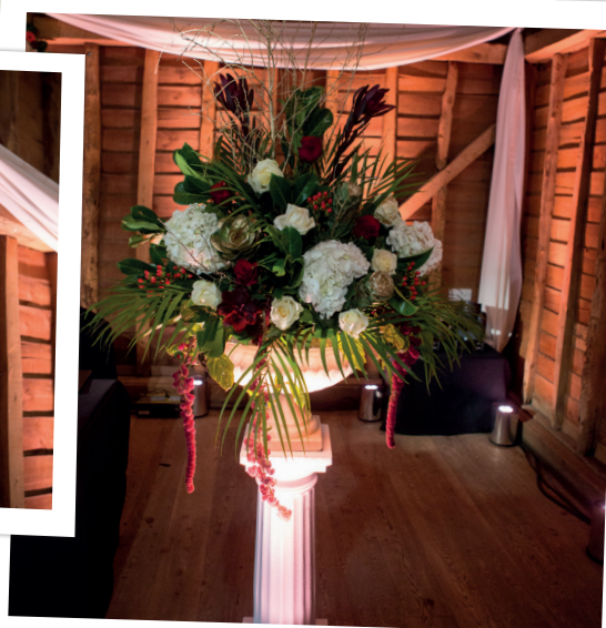
Large flower arrangements framed the altar and we used fairy lights and theatrical up-lighting to finish the look.