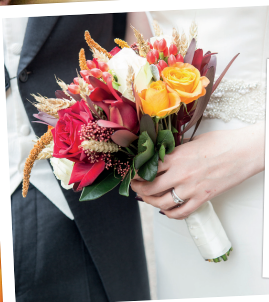
I wanted an Autumn-harvest bouquet - it had lovely, vibrant colours mixed with seasonal foliage.