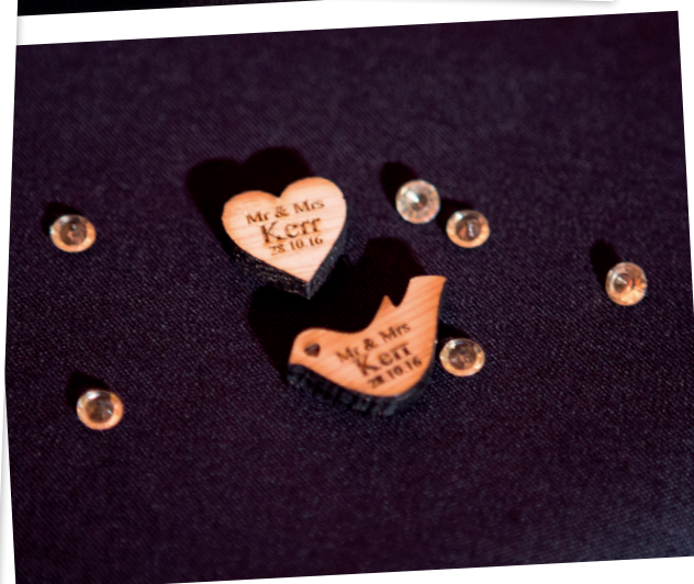
We sprinkled crystals, personalised wooden hearts and doves on the tables.