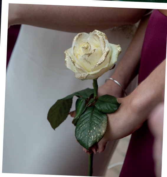
Our bridesmaids carried a single cream rose that had been dipped in gold glitter. They've always been one of my favourite flowers and they suited the look of our day.