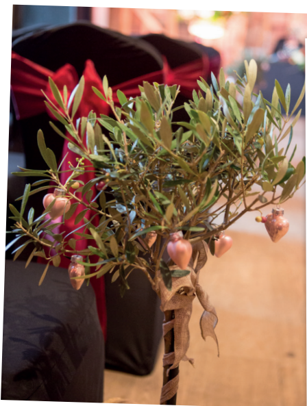
Small olive trees decorated with hearts and hessian ribbon lined the aisle.