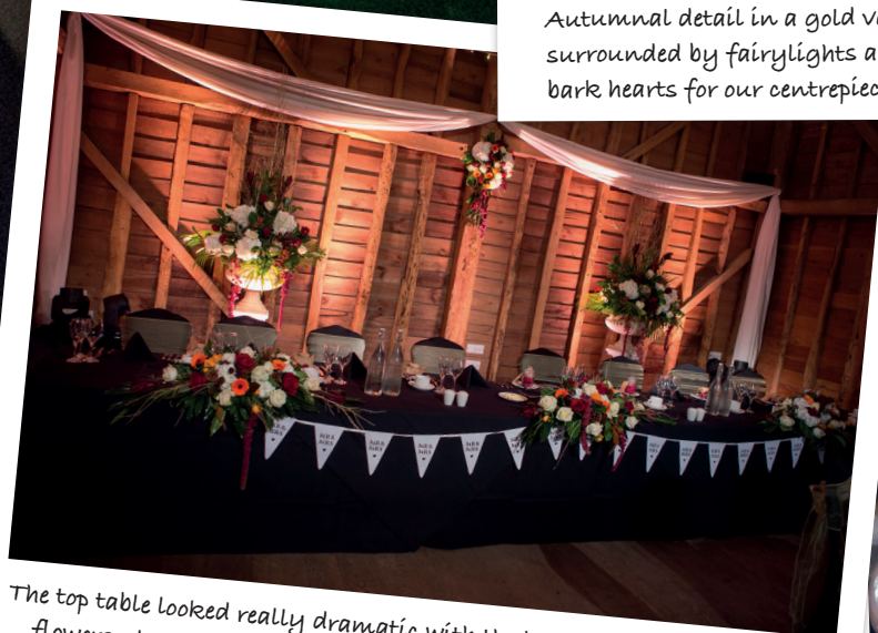
The top table looked really dramatic with the black tablecloths, seasonal flowers, drapes and lighting. I loved the 'Mr and Mrs' bunting too!