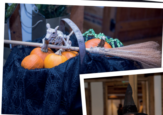
We decided to have a Halloween-themed reception, with a fancy dress option and a face painter and the band and DJ created one big party.