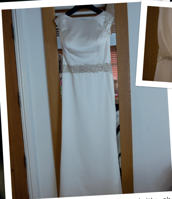
My dress was the first one I tried on and although I tried more, I just knew it was 'the one' as I felt extremely feminine and confident in it.