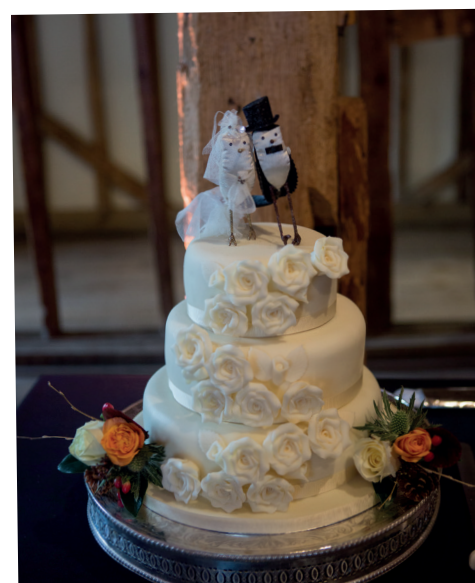
Our cake was simple and pretty and we decorated it with blooms and a lovely cake topper.