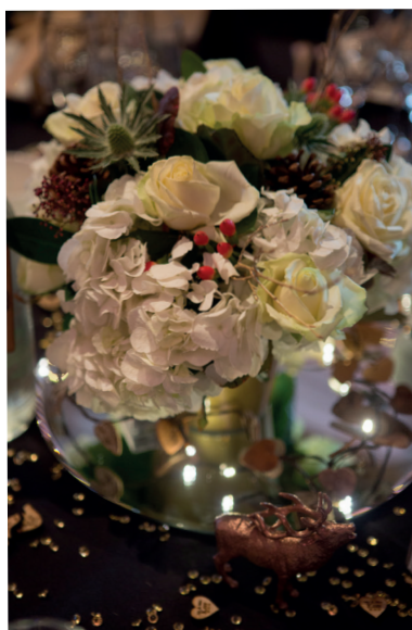
We opted for a rose design with Autumnal detail in a gold vase surrounded by fairy lights and bark hearts for our centrepieces.