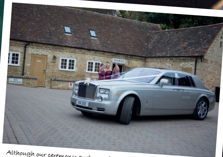
Although our ceremony and reception were at the same venue we still hired a Rolls Royce. My maid-of-honour put some champagne in there for us and it was nice to have some time with my dad beforehand.