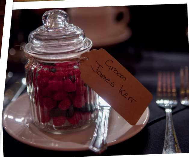
For our favours we filled glass jars with berry sweets and tied guest names to them with twine.