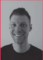
Shane Maple Florist