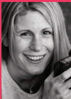
Becky Kerr Photographer